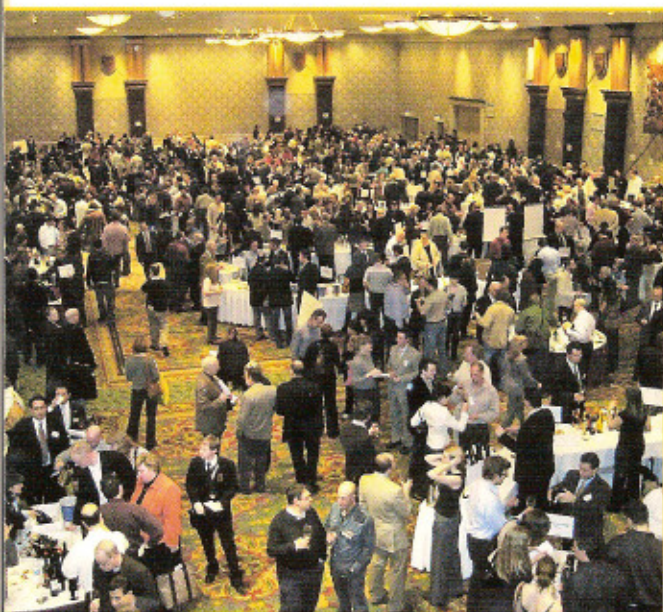
The Fairmont Royal York in Toronto was packed full of California wine fans.

Director of the Wine Institute of California. "We continue to make a serious commitment to building sales, a profile, and prominence in the Canadian market. Year after year, our vintners participate in the tour to renew friendships and relationships with members of the trade and retail sectors learning what's going on in their regions and sharing some of the exciting things they are doing in the cellar and in the vineyards."